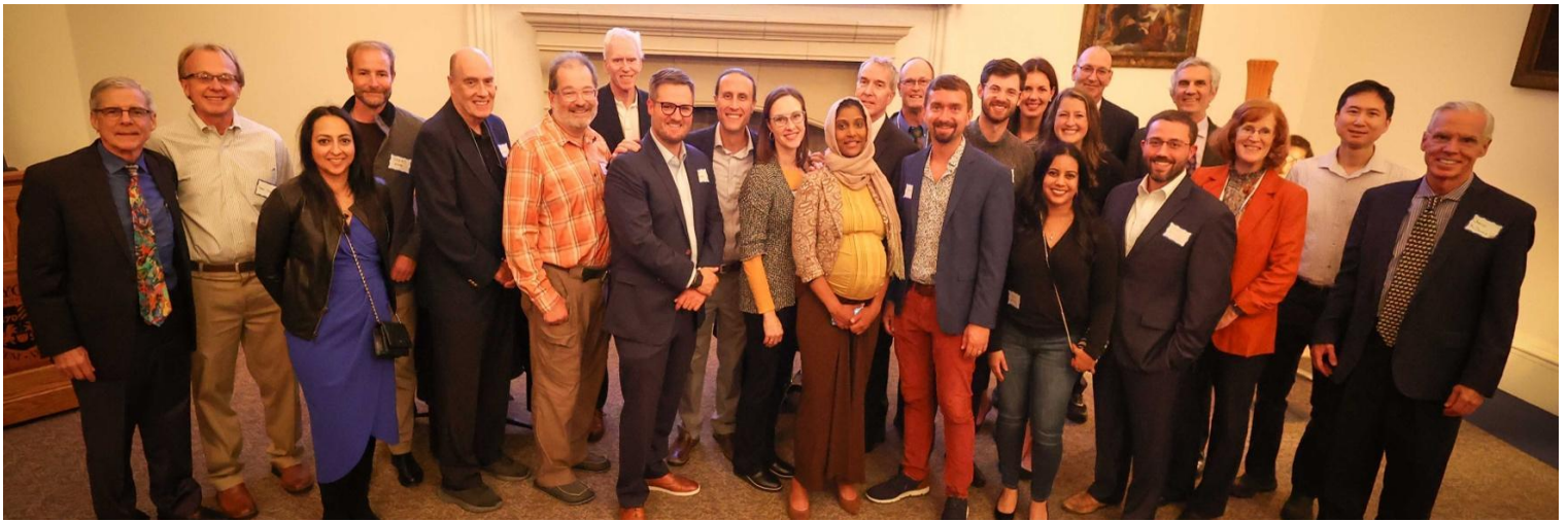
In October, alumni from throughout the years gathered at Loyola's Beane Hall to reconnect over AAO weekend. It was great to see so many familiar